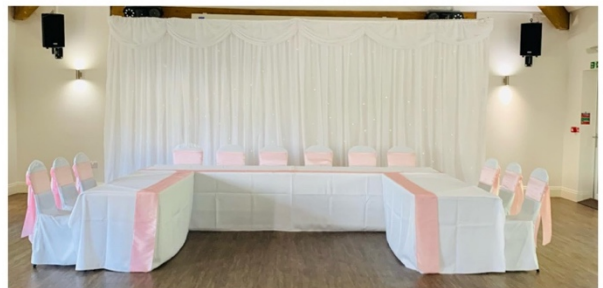
Table & chair dressing options are available at extra cost from other suppliers. Please see our website.